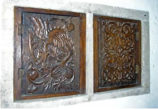
The seventeenth-century aumbry

The fine Jacobean carved pulpit has a low window behind it that would once have given light to an altar table in the nave. One has been recently reinstated in the same place.