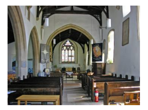
It is worth pausing to look down the full length of the church, to take in the distinctive bowed arch before the altar table, which is widest at the top.